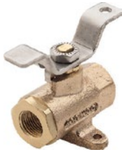
(OPTIONAL TEE HANDLE ILLUSTRATED)