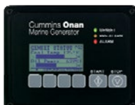
Cummins Onan Digital Display