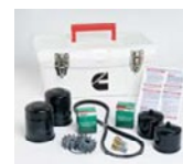
Cummins Onan Cruise Kit