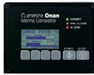
Cummins Onan Digital Display