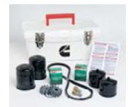
Cummins Onan Cruise Kit