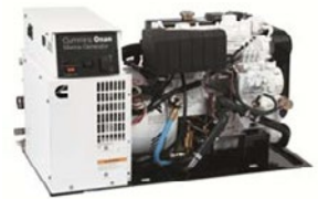
Standard model without sound shield shown