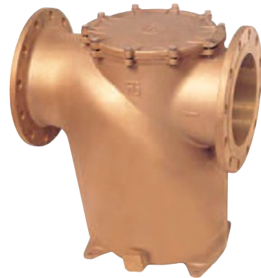
Tabella flange a pag. 182 Flange table on page 182