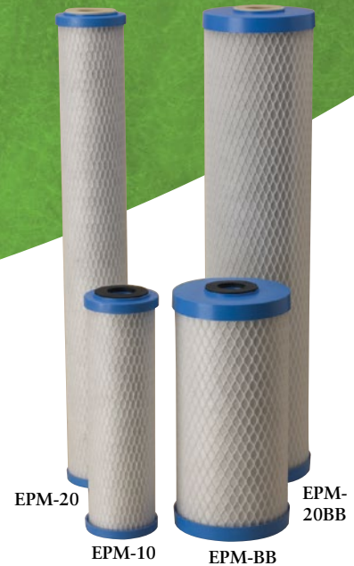
EPM-20 EPM-10 EPM-BB EPM-20BB

* Based on manufacturer's internal testing.