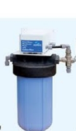
Optional Automatic membranes flushing filter