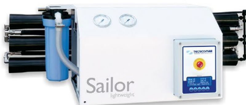
SAILOR SPECIAL 3/40 WITH ALUMINIUM FRAME