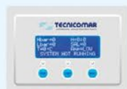
Optional CDMAR-2 Remote Control