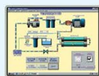
Optional Remote Control by on-board PC