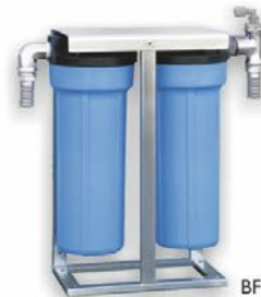
BFS 2 10"