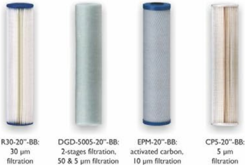
R30-20"-BB: 30 µm filtration