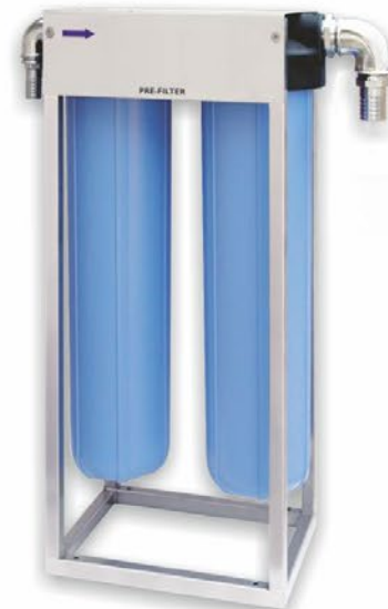
BFS 2 20"