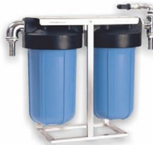
BFS 2 10"