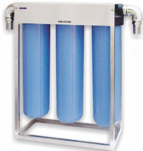
BFS 3 20"