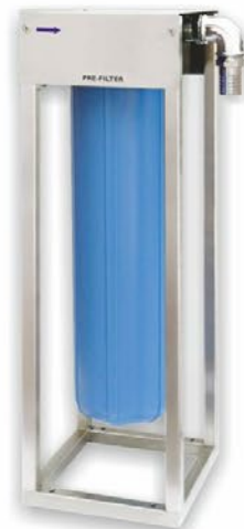
BFS 1 20"

For the BFS 2 and BFS 3 we suggest to combine a single or double filtration cartridge (BIG BLUE) and one with activated carbon. The BFS series can be used also as oil/water separator with coalescent cartridges. The flow rate may vary depending on the feed pressure and the cartridge type.